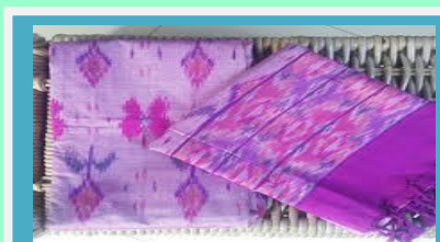
Kinds of Palembang ethnic and traditional weaving